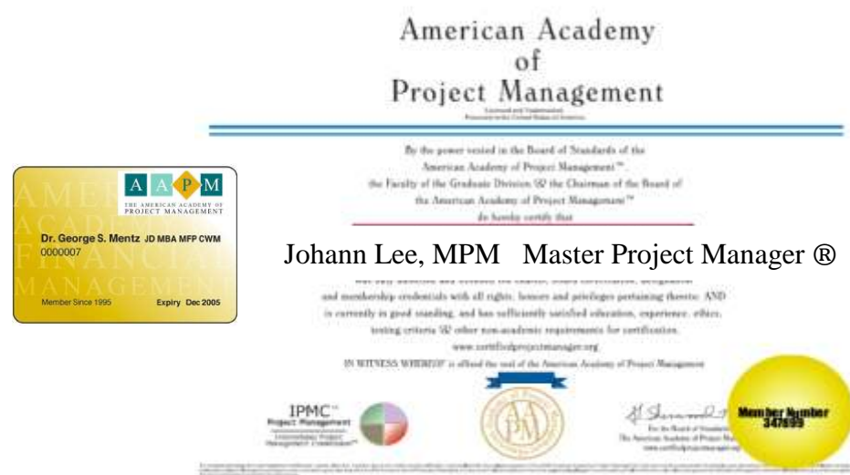
Figure 2 – Sample Certification and Fellowship declaration

The AAPM ® Quality Certification Documents can be displayed in plain view either mounted separately or together. The Certification, Membership & fellowship certification can only be displayed if you are in Good Standing with the Academy and you are recorded on the AAPM member register as a current member. US, Latin American and North American members receive the type of certification above. The approved official documents are more secure with even greater quality control.